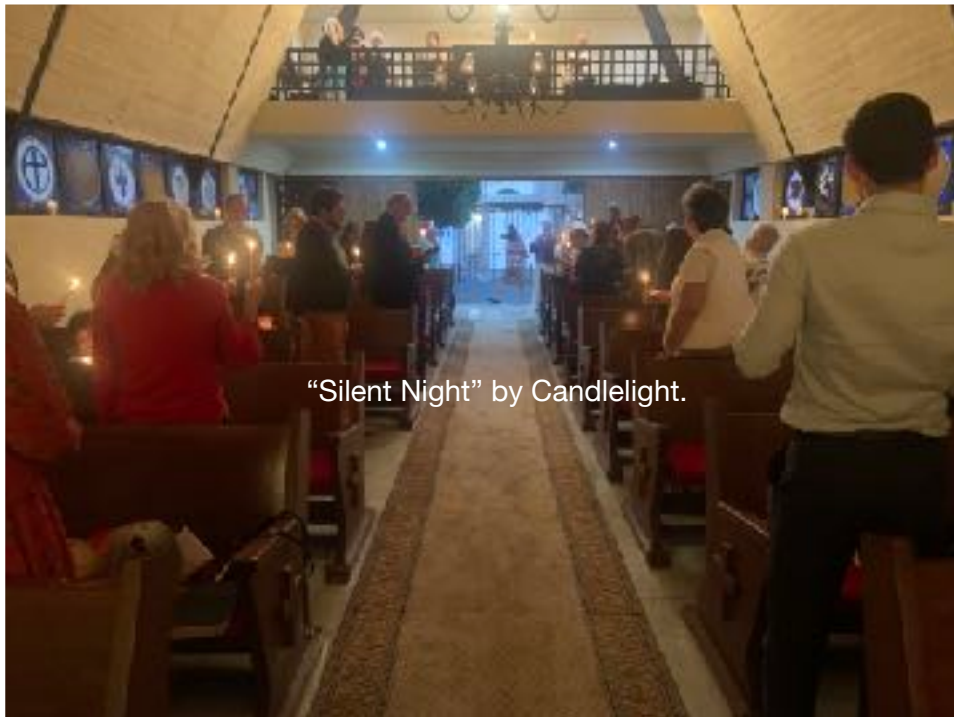
“Silent Night” by Candlelight.