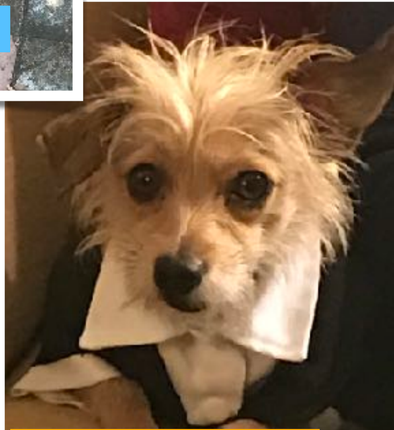
Isn't this a formal event?

May???? If so, please come to church on Sunday with your leashed dog ready to be photographed after services. This Sunday we will not only have human treats during the Hospitality Hour but dog treats in our makeshift photo studio. The dogs photographed here attended one of Amigo's birthday parties. Clothes may not make the man but they just might help win your dog the coveted Calendar Cover.